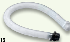
H-115 Breathing Tube