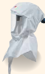
3M™ Versaflo™ Hood Assembly S-757 / 37301

Similar to S-655. The S-657 uses a double shroud design for its respiratory seal; wearers can select their preferred seal design. The S-657 is worn by tucking the inner shroud into a shirt or protective coverall, allowing excess air to be channeled over the body.