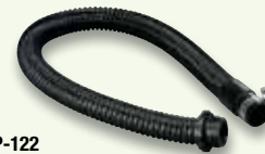
GVP-122 Breathing Tube