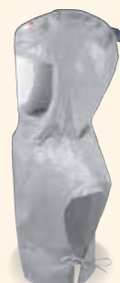
3M™ Versaflo™ Hood Assembly S-857

Similar to S-655 but made with Kappler® Zytron® 200, a polypropylene fabric with a multi-layer barrier film. Features sealed seams, making it suitable for environments where certain liquid splash hazards may be present. Includes a comfortable inner collar.