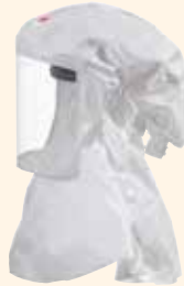
3M™ Versaflo™ Headcover S-433 Head, face, neck and shoulder coverage. Integrated suspension.