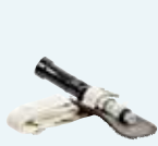
V-100/37018 Vortex Cooling Assembly