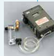
W-2808/37027 CO Monitor Retrofit Kit

IMPORTANT: These filter and regulated panel products do not produce Grade-D breathing air. The employer is required to ensure that the compressed air used with any supplied air system meets the requirements for Grade-D breathing air per the Compressed Gas Association Commodity Specification G-7.1-1997. In Canada, refer to CSA Standard Z180.1 for the quality of compressed breathing air.