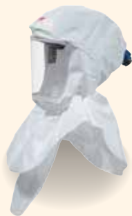
3M™ Versaflo™ Hood Assembly S-657

Head, face, neck and shoulder coverage. Its respiratory seal is a comfortable, knitted inner collar that is shorter and thinner than previous models. General purpose, cost-effective fabric.