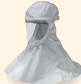
3M™ Versaflo™ Economy Hood S-403 Head, face, neck, and shoulder coverage. Fabric suspension, inner shroud.