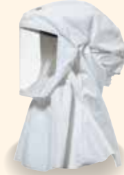
3M™ Versaflo™ Hood S-533 Head, face, neck, and shoulder coverage. Comfort suspension. Durable, soft, quiet, low-linting fabric that drapes more comfortably over the wearer.