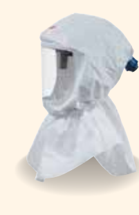
3M™ Versaflo™ Hood Assembly S-655

Head, face, neck and shoulder coverage. Its respiratory seal is a comfortable, knitted inner collar that is shorter and thinner than previous models. General purpose, cost-effective fabric.