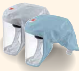
3M™ Versaflo™ Headcover S-133 and S-133B Head and face coverage. Integrated Comfort suspension. General purpose fabric.