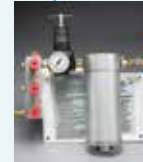
W-2806/07006 (50 cfm) without CO Monitor

IMPORTANT: These filter and regulated panel products do not produce Grade-D breathing air. The employer is required to ensure that the compressed air used with any supplied air system meets the requirements for Grade-D breathing air per the Compressed Gas Association Commodity Specification G-7.1-1997. In Canada, refer to CSA Standard Z180.1 for the quality of compressed breathing air.