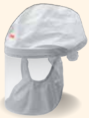
3M™ Versaflo™ Economy Headcover S-103 Head and face coverage. Fabric suspension.