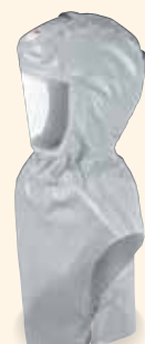
3M™ Versaflo™ Hood Assembly S-855

Similar to S-657 but with a fabric specifically intended to help capture paint overspray, minimizing the potential for paint to flake off the wearer and onto the work piece. Fabric has an internal film barrier to help prevent paint contact with skin or clothes.