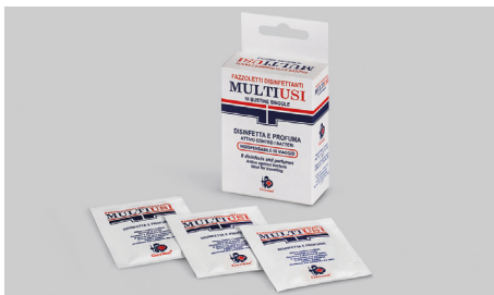
Q530 – Multi-purpose disinfectant wipes.