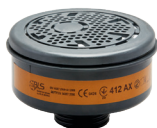
Filters BLS 400 series