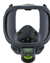
Full face masks BLS 3000