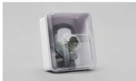
C90 – Wall mounted container.