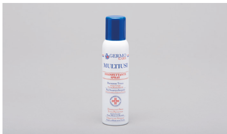
Q409 – 150ml disinfectant spray bottle.