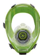
Full face masks BLS 5400 - BLS 5150