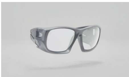
C22 – Frame for prescription lenses.