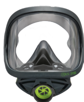
Full face masks BLS 2150 - BLS 2150V