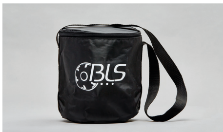
C43 – Washable bag with shoulder belt.